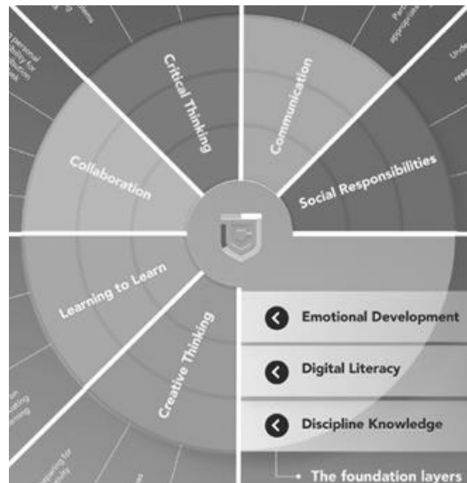
Figure 1. Cambridge life competencies framework [2]

task, formative assessments were conducted to check the learning outcomes of each learning stage. Then a summative assessment was carried out through a group final project to evaluate students' language learning and competency development at the end of the intensive course. At last, an online survey was conducted before and after the implementation of the model to further understand students' feedback about the proposed model.