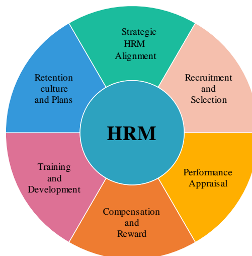
Figure 1. HRM practices

All HRM processes—whether they are regular practices or innovative procedures—have the same goal. This is to develop human resources to make use of specialized skills in the workplace in such a way as to ensure good quality. Employees are thus encouraged to stay with their organization for a long time, which contributes to these organizations' chances of success.